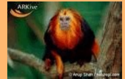
Golden Lion Tamarin

Who are my relatives? I am a mammal of the Primate order and the Callitrichidae family. I belong to a class of monkeys called New World monkeys that live in central and South America. (Old World monkeys live exclusively in Africa and Asia.) The ape and prosimian are different from both Old and New World monkeys.